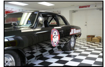
JR Motorsports in Ankeny, Iowa