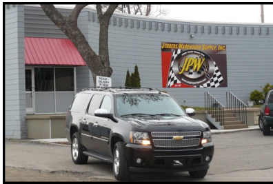
Jobbers Warehouse in Minneapolis, MN

Milestone Marketing Group goes the extra mile for you! Call today to find out more!