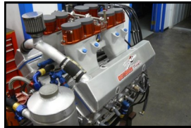
Ostrich Engineering in Des Moines, Iowa