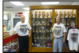
Patterson Racing in Augusta, KS

Racing is not just about the cars. It's also about a special group of hard working, race enthusiasts who have a passion for the sport, and love of the business!