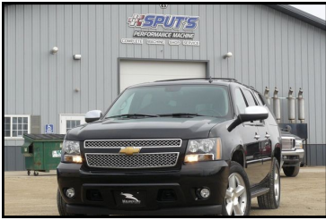
Sput's Racing Engines in Owatonna, MN

Milestone Marketing Group goes the extra mile for you! Call today to find out more!