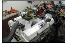
Sput's Racing Engines