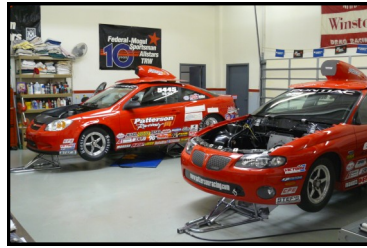
Patterson Racing in Augusta, KS