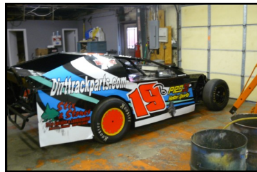
Pro Motorsports in Wichita, KS

Racing is not just about the cars. It's also about a special group of hard working, race enthusiasts who have a passion for the sport, and love of the business!