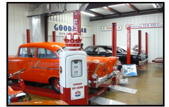
Above and below: Patterson Racing in Augusta, KS