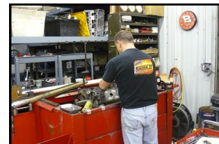
Ostrich Engineering in Des Moines, IA