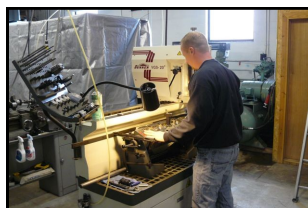
KS Engineering in Albert Lea, MN