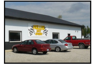
Mullins Race Engines, Mount Olive, IL

Yet it is the same as you can already tell.