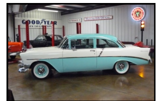
Bier Brothers Performance in O'Fallon, MO