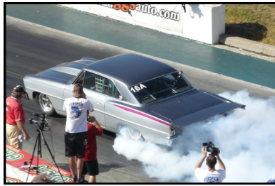
Above: Hot Rod Week in Topeka, KS Below: Brainerd, MN Races