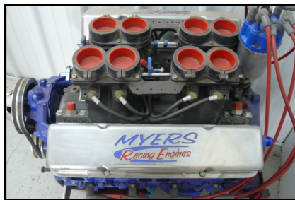
Above: Myers Engine Service, Ness City, KS Below: Champion Brands at Hot Rod Drag Week in Topeka, KS