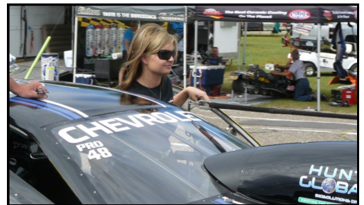
Erica Enders, Race Car Driver and ZaZa Energy