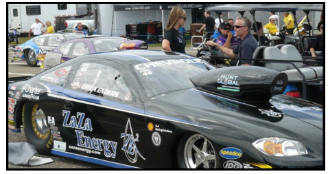
Above and below: The Brainerd, MN Races